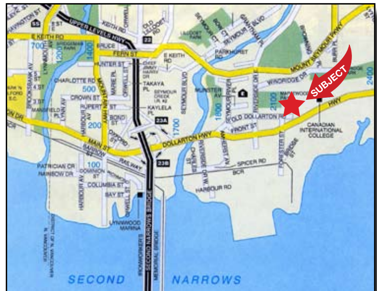
Map courtesy of "StreetWise" Map Book

For further information, please contact sales representatives